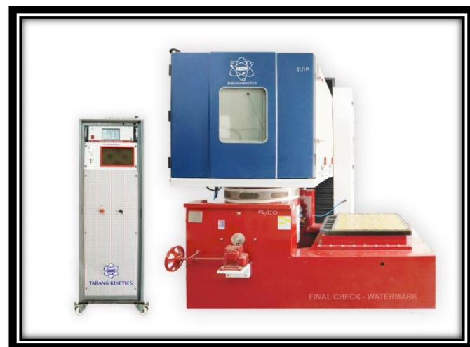
VIBRATION AND SHOCK MACHINE WITH CLIMATIC CHAMBER 3.5T