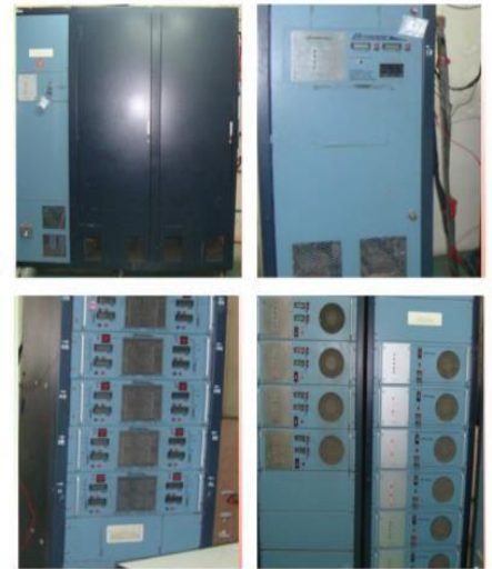
BITRODE BATTERY TEST SYSTEM