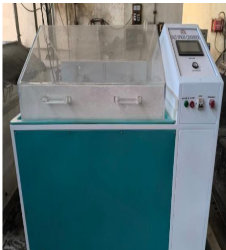
SALT SPRAY CHAMBER